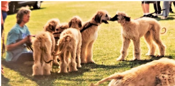
Above: Bonnie socializing puppies.

I wonder if most people who only lure course realize the difference between the two types of running hounds. The sprinters are the Greyhounds, Whippets, Borzoi, and the endurance dogs are Salukis, Afghan hounds. I like hunting a combination of sprinters and endurance together. The sprinter's job is to put immediate pressure on the game, producing early turns. As the sprinter begins to slow the endurance dog takes over, putting long distance pressure on the game. These unique qualities of the sighthounds are hard to observe or realize when only having participated in lure coursing.