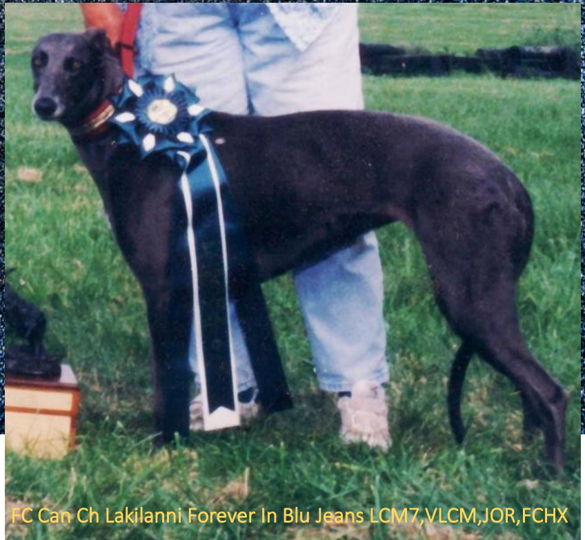
FC Can Ch Lakilanni Forever In Blu Jeans LCM7,VLCM,JOR,FCHX

Below Left: "Maddie" DC GRCh Can Ch Lakilanni Love Her Madly LCM7,VLCM,FChX3,CD,RE